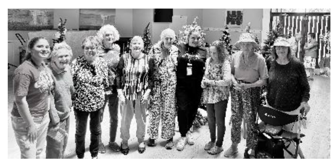
Some of the residents from Cape Care Dunsborough enjoying their visit to the Christmas Tree Display