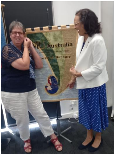
A moment of hilarity as my MU earring came out